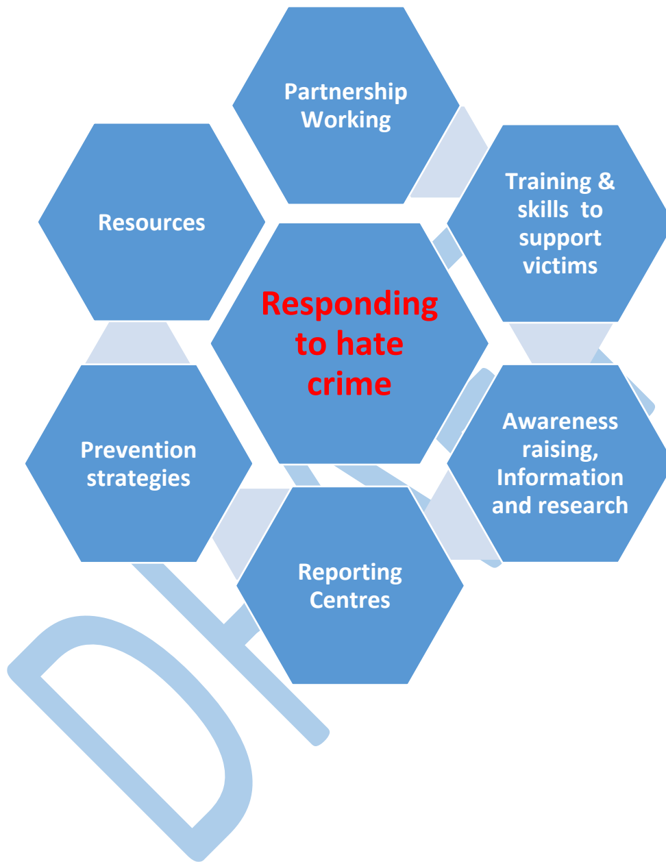
Diagram 1: Hate crime consultation core themes